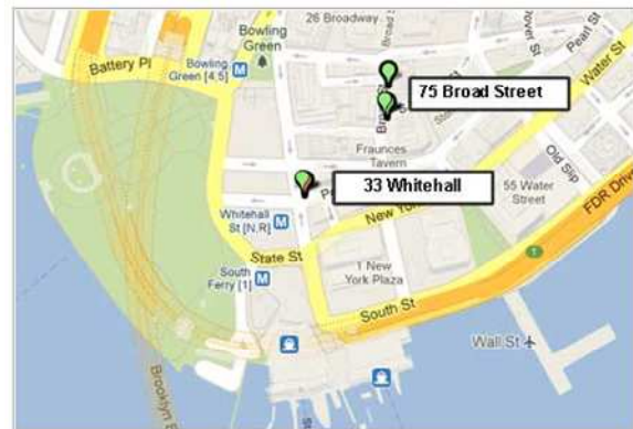
Data Center Knowledge

Many of the data centers are web hosting providers. It is estimated that tens of thousands of web sites around the world were taken down as a result of the failure of these providers.