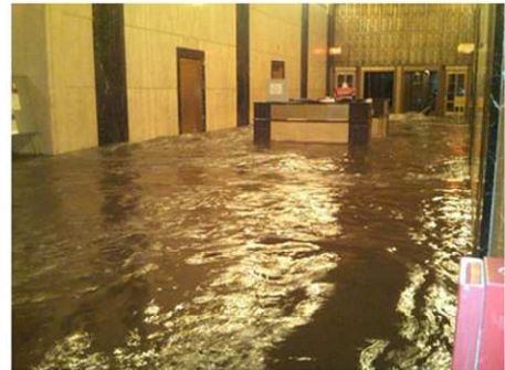
Lobby of one of Verizon's primary Manhattan facilities

The storm surge flooded several of Verizon's facilities in lower Manhattan, interrupting both utility power and backup power. These sites were rendered inoperable. Verizon teams were unable to access some sites.