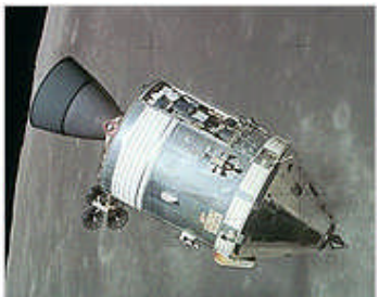
The Command Module

The AGC ran the LM's Primary Guidance, Navigation, and Control System (PGNCS). The PGNCS was backed up by the Abort Guidance System (AGS) designed by TRW. The AGS could