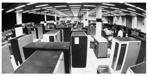
The Apollo 11 IBM Computer Room

The 360s had a speed of 1.7 MIPS (million