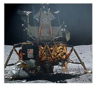
The Landing Module

Modern-day PCs may be more powerful than the AGC, but the AGC did much more than plug into a printer and a router. It interfaced with ground telemetry links, radar rendezvous systems, landing altimeters, gyro compasses, optical star trackers, and propulsion systems.