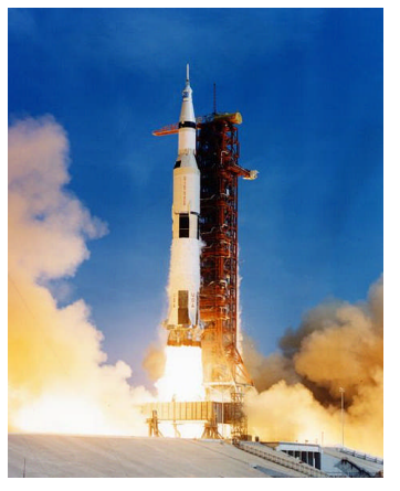
The Saturn V Launch Vehicle