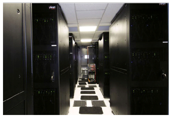
Inside a Microsoft Data-Center Container

Microsoft claims that containers will form the basis of all of its future data-center designs.