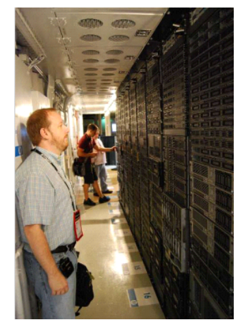
Inside the HP POD

Within the POD are twenty-two 19-inch standard 50U racks providing 1,100U of rack space. The racks can hold up to 160 servers each for a POD total of 3,520 servers. Being standard racks, any vendor's equipment designed for these racks may be used, including servers from IBM, Dell, and Sun and networking gear from Cisco. Alternatively, a POD can be configured with up to 12,000 hard drives, providing total storage of 12,000 petabytes. Any combination of servers, storage, and network equipment may