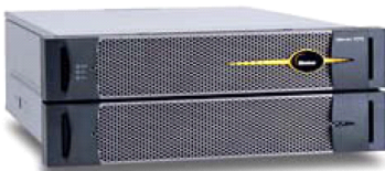
The Stratus ftServer

The high availability of the Stratus ftServer product line is achieved by running all applications on dual processors that are lockstepped at the memory-access level. Should there be a disagreement between the processors, one of the processors has suffered a fault. If the faulty processor has detected its own fault, that processor is taken out of service. Otherwise, each processor enters a self-test mode; and the processor in error is taken out of service.