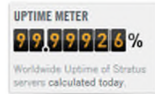
Stratus ftServer Uptime Meter as of February 20, 2015

ftServer uses dual modular redundancy to provide plug-and-play fault tolerance to Windows, Linux, and virtualized applications. To measure the availability of its servers in the field, Stratus monitors its service incident reports and updates an Uptime Meter daily, which it displays on its ftServer web site. 2 The Uptime Meter covers all hardware, operating system, and hypervisor failure incidents and consistently shows an availability of five 9s or better (an average of five minutes of downtime per year or less).