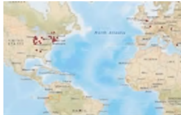
GIS Location Visibility

With Everbridge's GIS (Geographic Information System) technology, an interactive map can be displayed on a terminal or on a mobile device showing the location of various potential recipients. The recipients can be selected from the map.